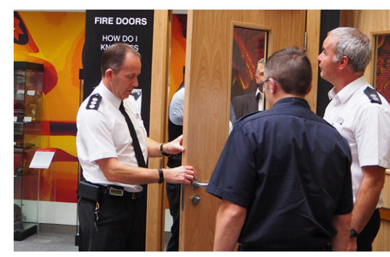
BWF working with London Fire Brigade at a dedicated Fire Door Awareness event during Fire Door Safety Week