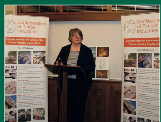
Environment Minister Dr Thérèse Coffey MP talks of the "fantastic contribution timber industry makes to the UK economy" at a CTI sponsored reception