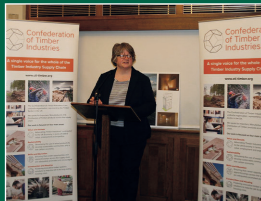
Environment Minister Dr Thérèse Coffey MP talks of the "fantastic contribution timber industry makes to the UK economy" at a CTI sponsored reception