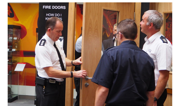
BWF working with London Fire Brigade at a dedicated Fire Door Awareness event during Fire Door Safety Week