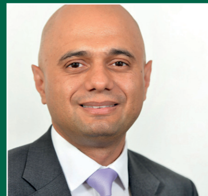
The Rt Hon Sajid Javid Secretary of State for Housing, Communities and Local Government writes to BWF to thank for support in post Grenfell Review and suggest follow-up meeting on Building Safety Fund