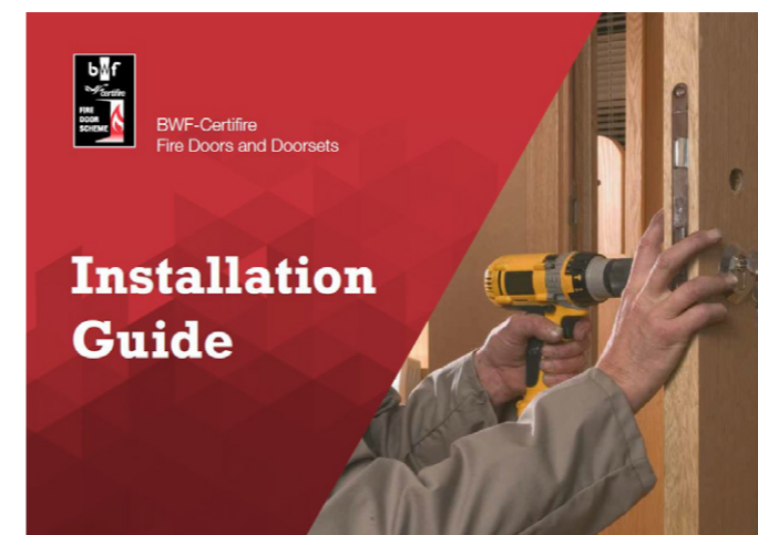
Our Fire Door Installation Guide was also launched at a live demo at the Exhibition